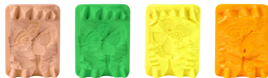
#800 Tan #801 Pistachio #802 Lemon #803 Peach

Available in standard tan color and the exciting new Gelato rainbow of colors!