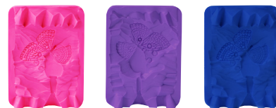
#804 Fuchsia #805 Violet #806 Blue