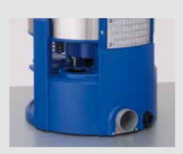
Connection to controlled exhaust air routing