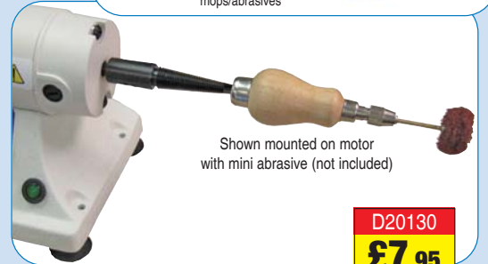
Shown mounted on motor with mini abrasive (not included)

3. This end wind onto your right hand side of your polishing taper spindle