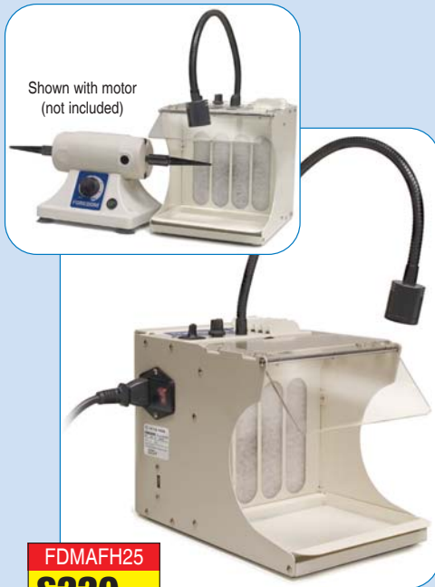
Shown with motor (not included)