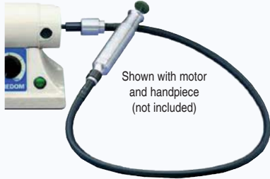
Shown with motor and handpiece (not included)

Convert your polishing motor into a flex shaft machine with a 30" long Flexade with a standard sheath.